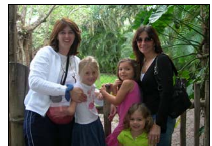
Our day at the zoo!

We hope that 2007 is a wonderful year for all!