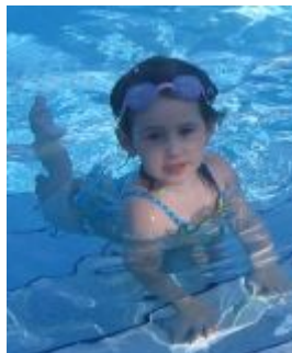
At the pool.